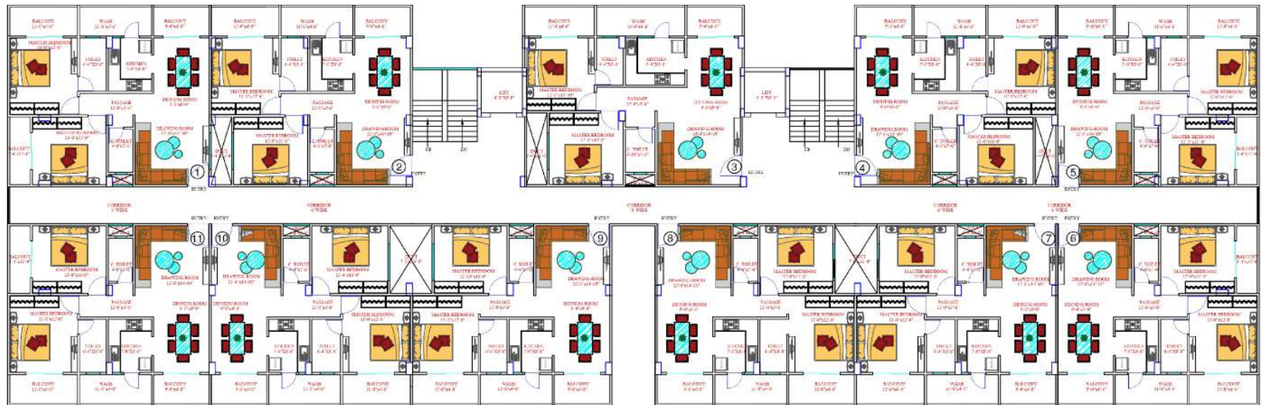
FIRST FLOOR FURNITURE PLAN